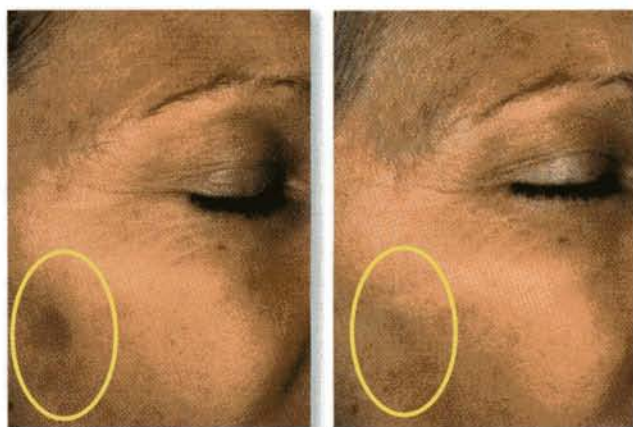
Patchy discoloration can be seen prior to taking collagen replacement drink (left). After treatment at right.

"The diminished appearance of fine lines and wrinkles was impressive. I was even more impressed with the fading of discolored spots